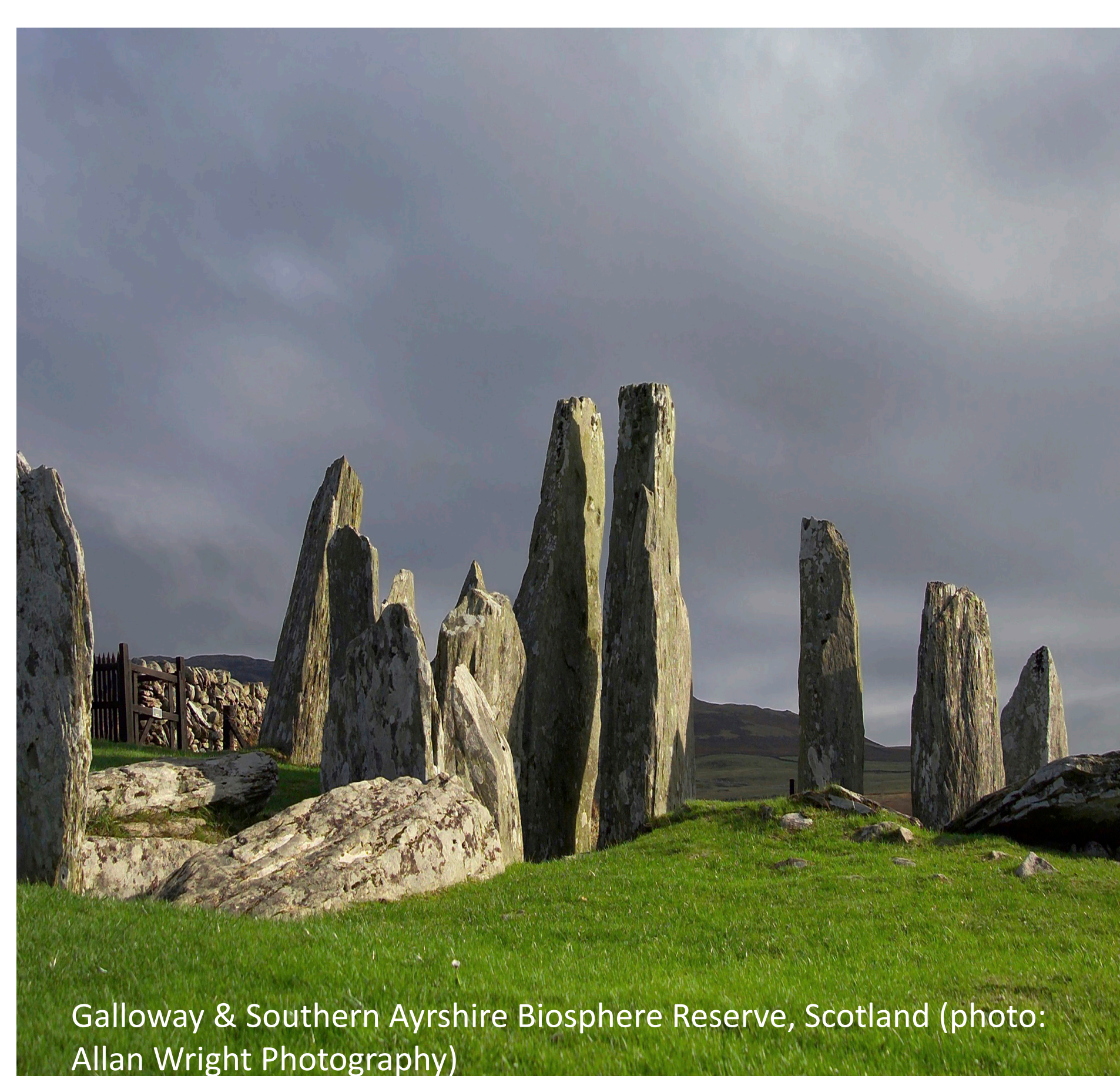
Galloway & Southern Ayrshire Biosphere Reserve, Scotland