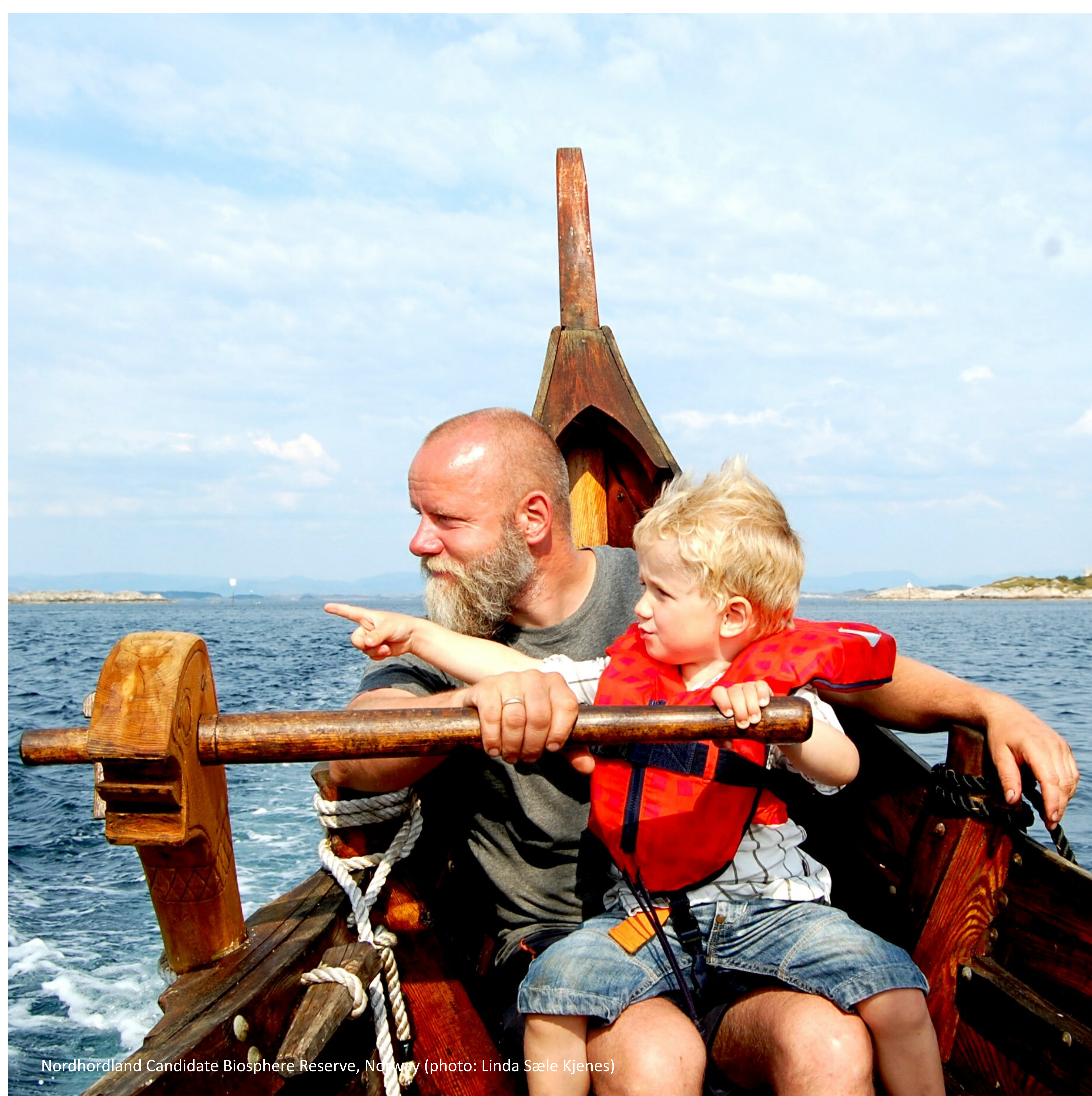
Nordhordland Candidate Biosphere Reserve, Norway

Sustainable Heritage Areas: Partnerships for Ecotourism