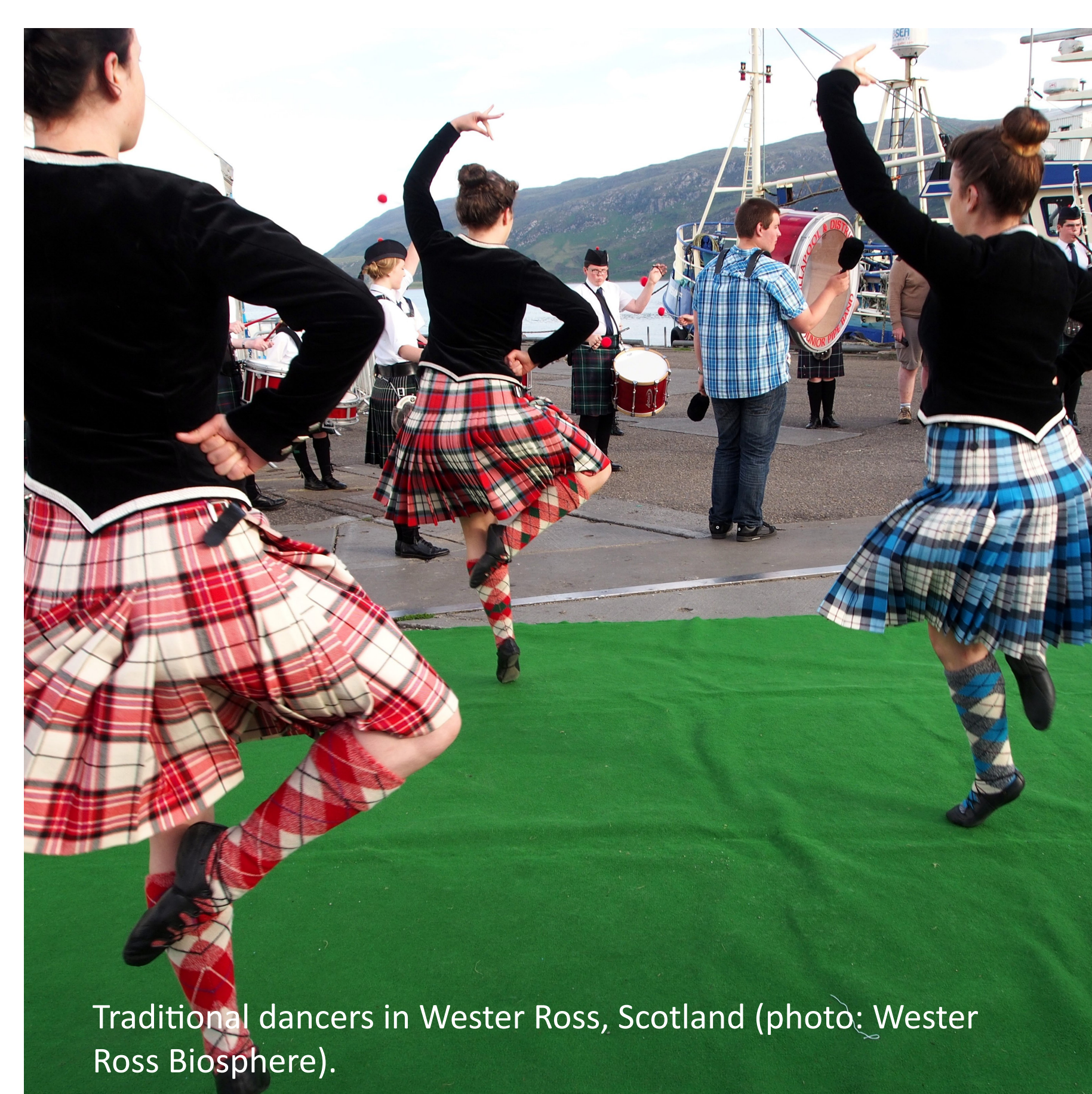
Traditional dancers in Wester Ross, Scotland.