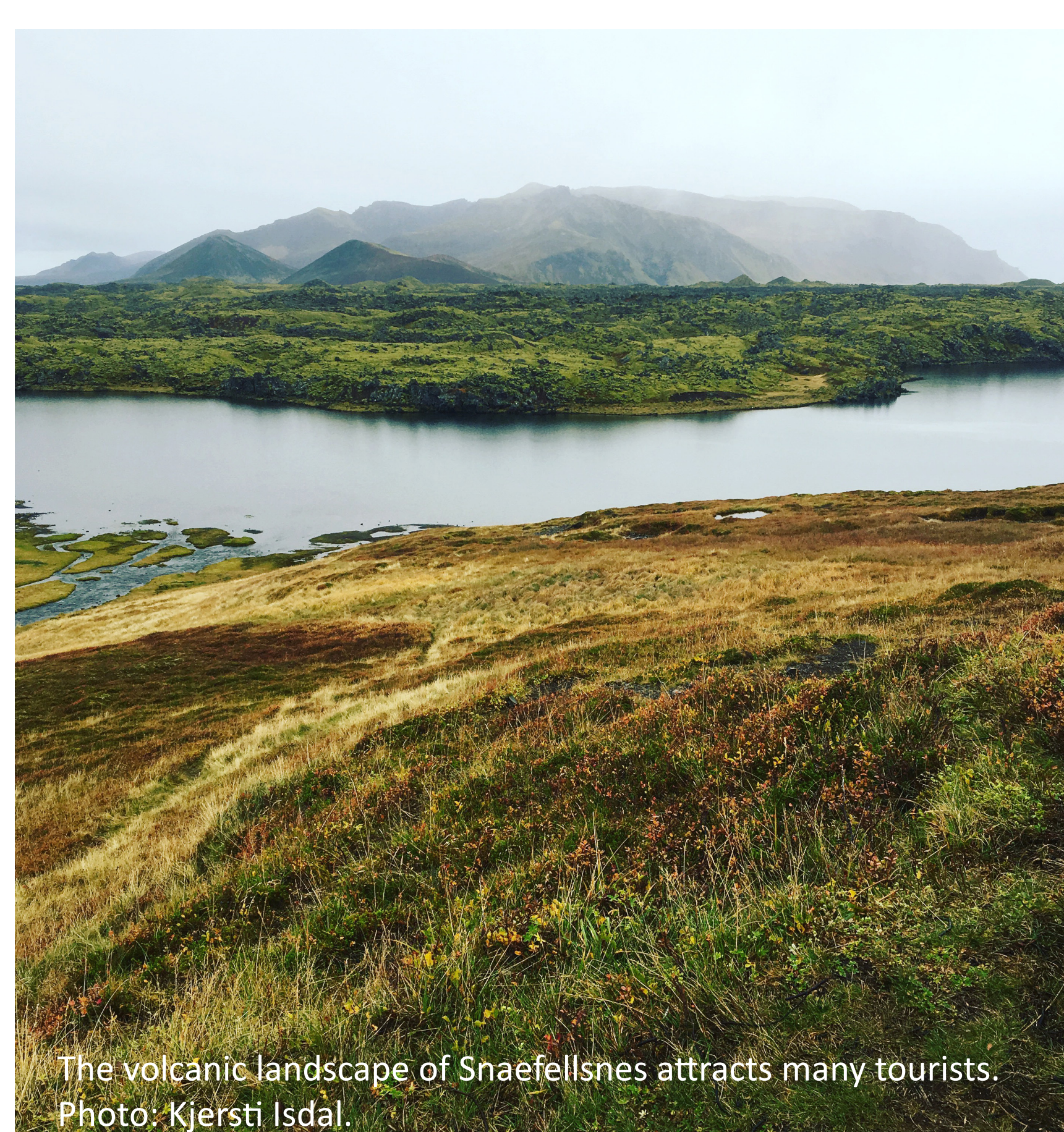
The volcanic landscape of Snaefellsnes attracts many tourists.